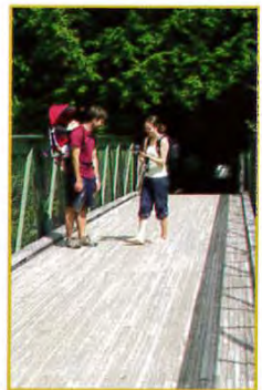
Ramps and limited trails allow everyone to experience the beauty of the Gorge.

Modern steel bridges, walkways and groomed paths provide safe access for all ages and abilities right into the middle of the waterfalls. Ramps and selected trails allow accessibility for everyone to experience the beauty of the Gorge. For safe foot-travel in almost any winter weather conditions, we provide YakTrax* – light-weight, easy-to-use traction devices for your shoes.